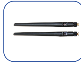
Rubber Duck Antenna*2